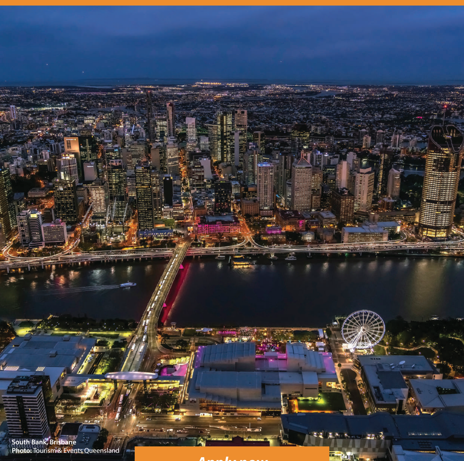
South Bank, Brisbane